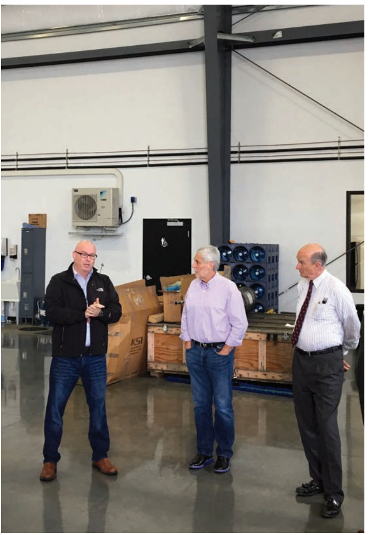
The PDX CAC toured seven different areas on and around PDX as part of their October meeting. This gave them a "hands on" opportunity to view projects and locations that had been the subject of CAC presentations and discussions.