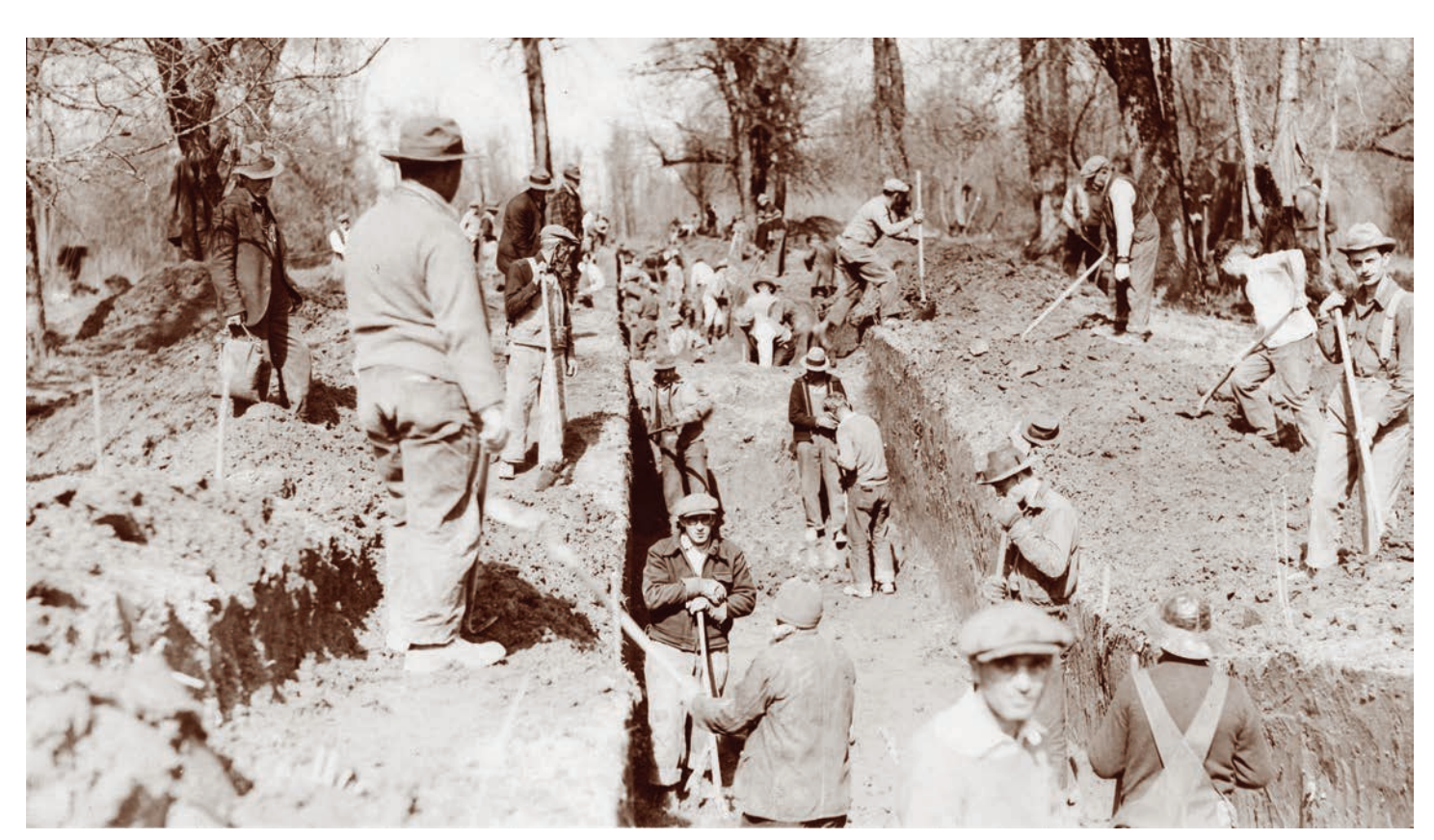
1936 WPA work crew installing a diversion drainpipe for airport fill placement, in preparation for construction of Portland International Airport. The pipe was recently replaced as part of the Colwood pipe replacement project.

CAC officers will present annual report to Port of Portland Commission on April 13.