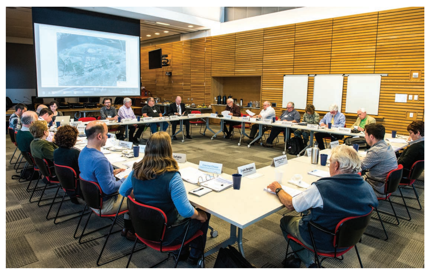
The PDX CAC meets quarterly to discuss and give input on airport planning, development and sustainability topics.