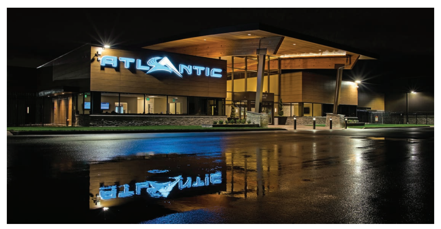
The new Atlantic Aviation facility opened in spring 2017. This general aviation project was presented to the PDX CAC for review and discussion, and included broad public notice consistent with plan district requirements.