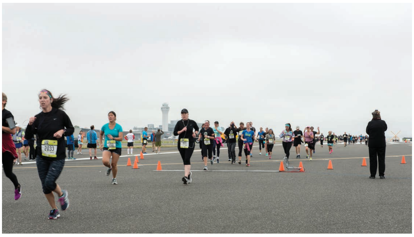
Connecting the community to the airport is one of the main interests of the PDX CAC. The PDX Runway Run brought the public onto the airport's north runway on September 24 and raised over $20,000 for the Boys and Girls Club of Portland Metropolitan area.