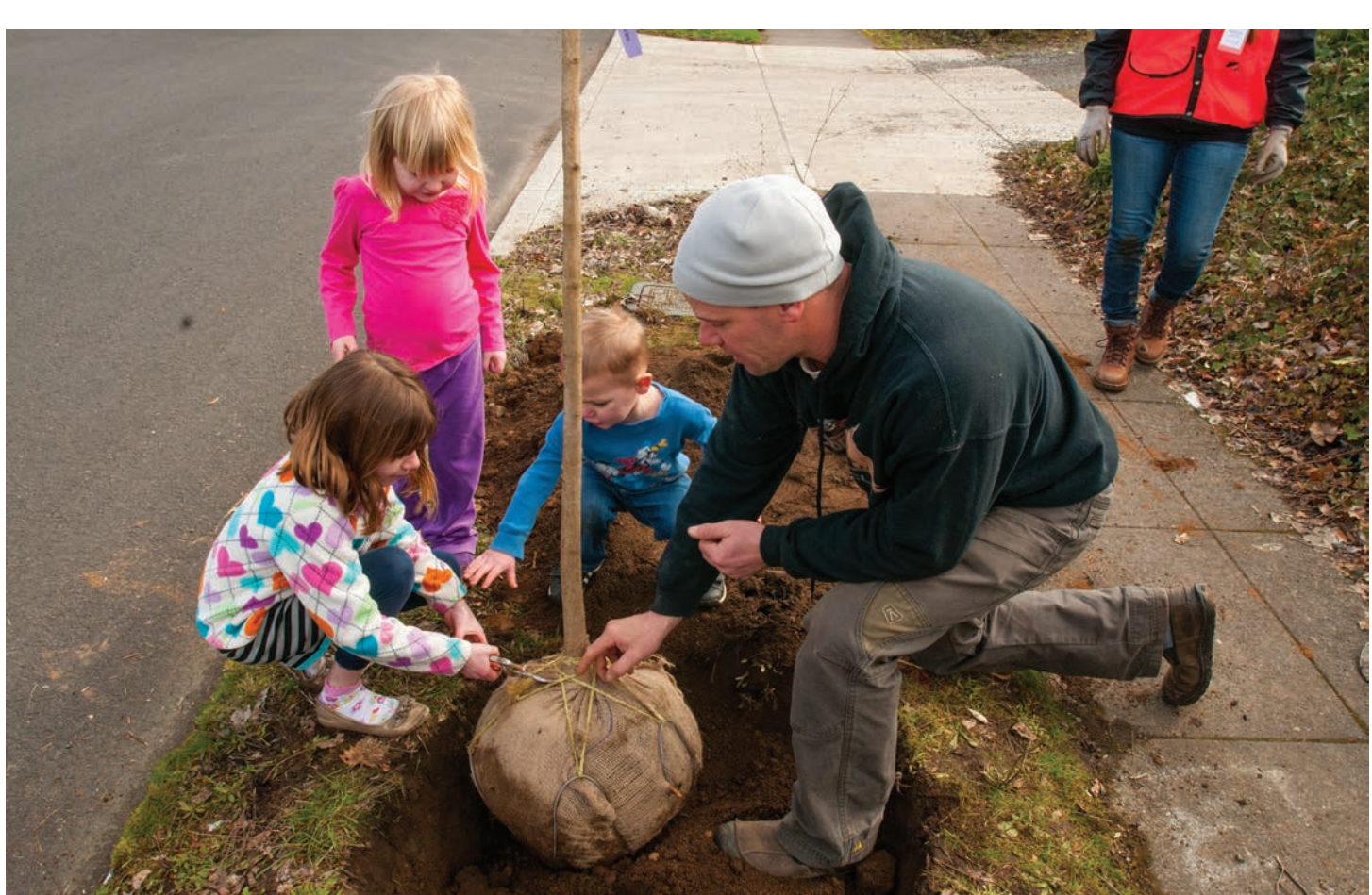
The Port sponsored Friends of Trees plantings in seven neighborhoods this fiscal year.

The first recommended project would provide funding to Friends of Trees for the next three years in order to implement multi-year natural area plantings at Columbia Children's Arboretum, the Columbia Slough Natural Area, and May's Lake and multi-year neighborhood tree plantings at non-owner occupied residential properties, with a focus on neighborhoods impacted by airport operations. These communities are Argay, Concordia, Cully, Parkrose, Parkrose Heights, Piedmont, Russell, Sumner, Vernon, Wilkes, and Woodlawn.